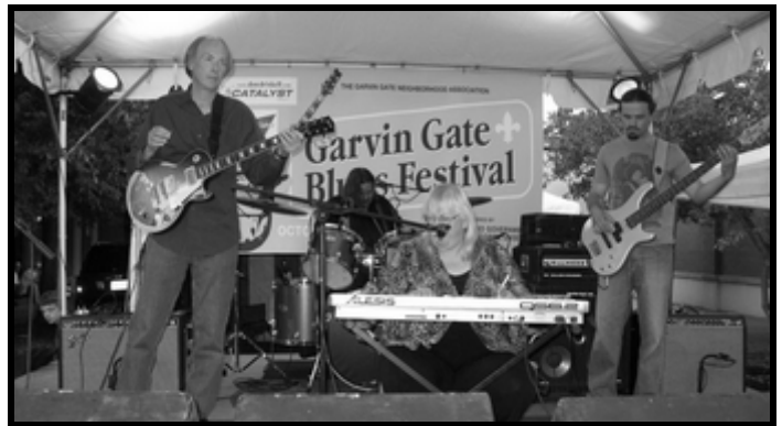
Friday – Pure Gravel Band