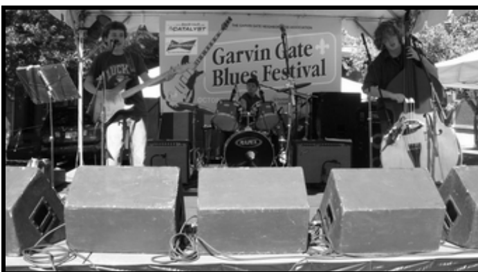
Saturday - School of Rock