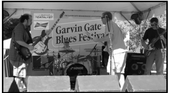
Saturday - Leisure Thieves