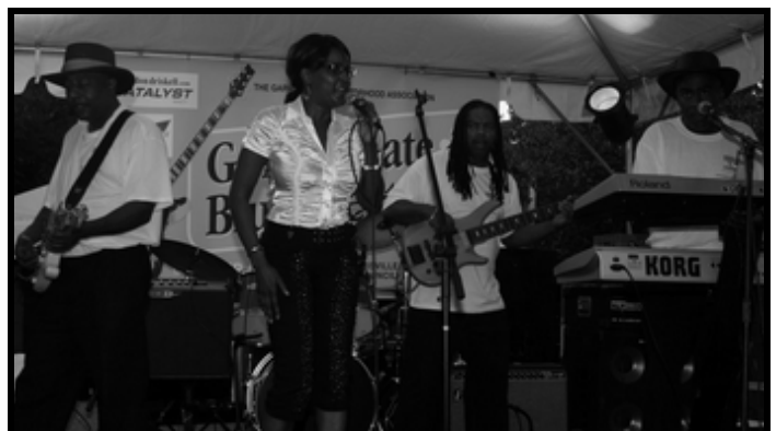
Saturday - Walnut Street Blues Band