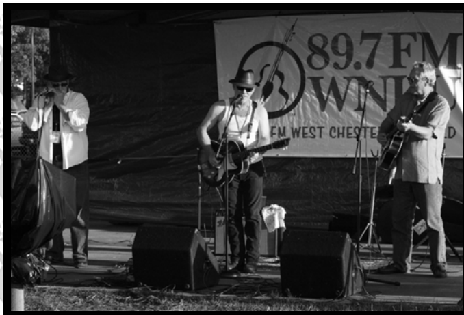
Lazy Eleven