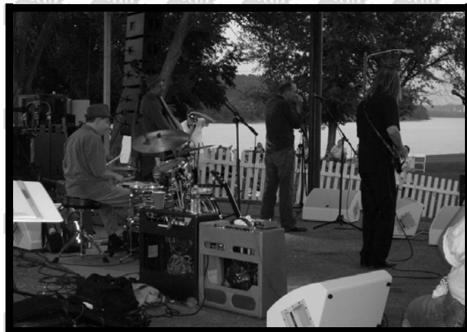
Carrollton's Point Park, where the beautiful Ohio and Kentucky Rivers meet