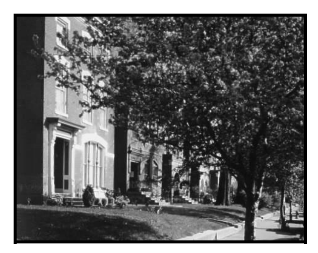
Mayor Fischer and friends, juggler, and historic homes