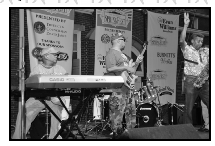
Booths at the first annual Old Louisville Springfest, (L), and music by Walnut Street Blues Band (R)