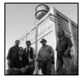
Dirty Church Revival Pillar of Salt Self Produced

Right off the bat, "Pillar of Salt" seems an appropriate title of a recording from an aptly-named local rock-roots-and-blues band called Dirty Church Revival. The Biblical reference, from the Old Testament, is of doom and destruction. At its worst, of course, blues is all about that, and at its best, it's about sadness and loss. One has only to look at the titles on this CD ("It Ain't Easy," "$45 Blues," and "Hellbound Train" for example) to see that.