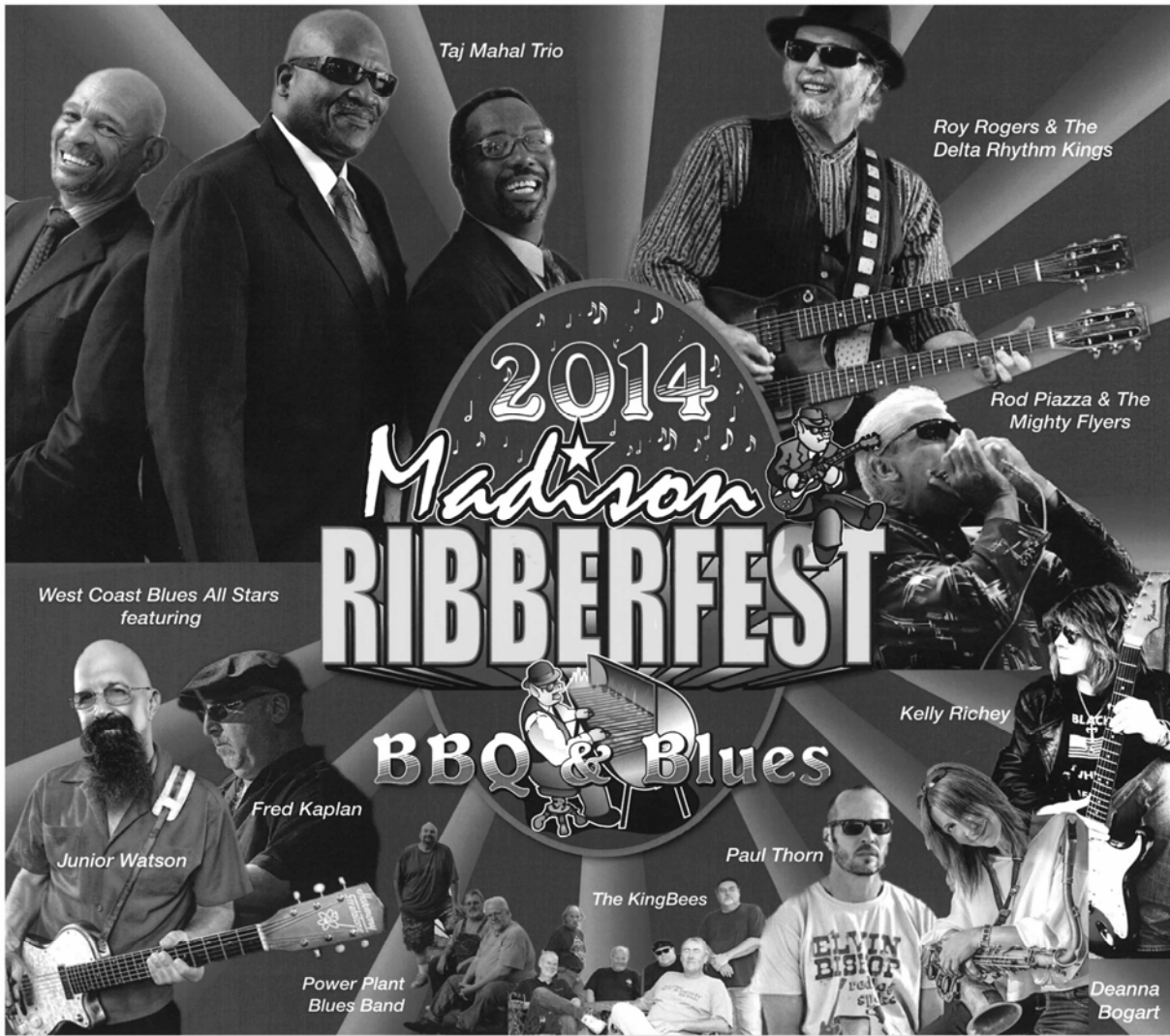
Taj Mahal Trio