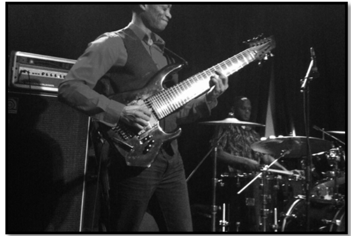
Nine-string bass at Purple Haze

I look at the notes I took on a few of these performances and they make me smile in remembrance.... For instance: