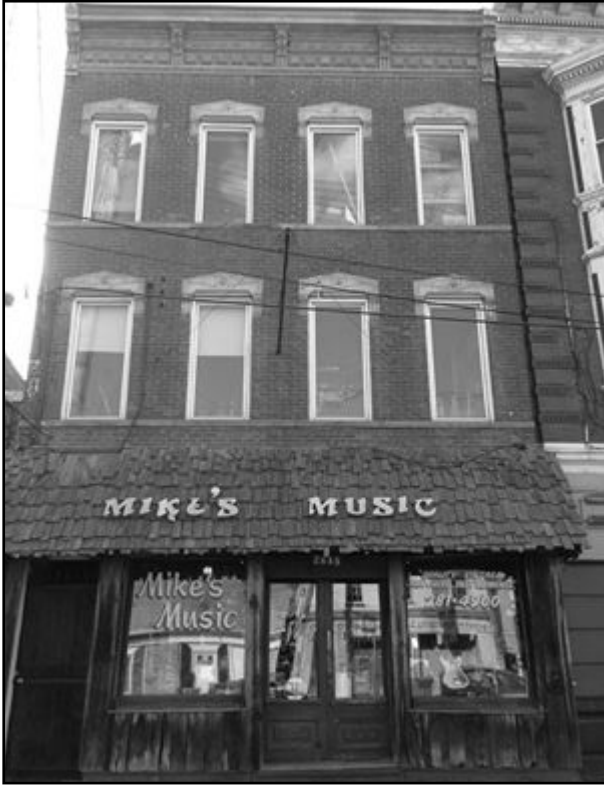
Cincinnati Store at 2615 Vine Street