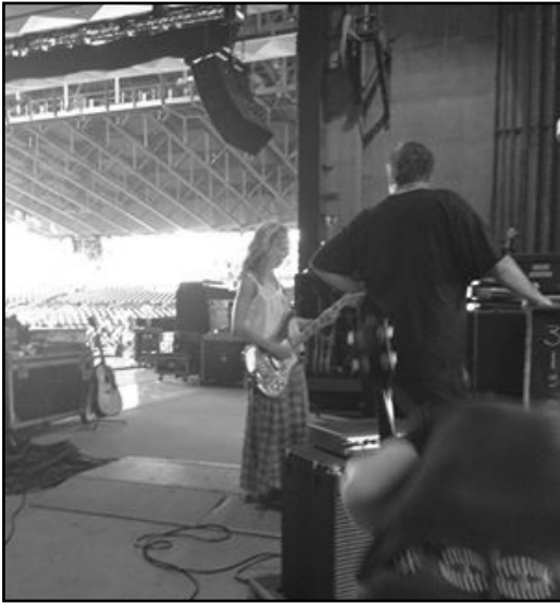
Sheryl Crow at the Cincinnati store.