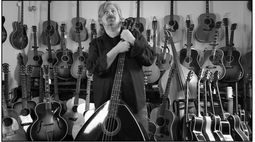
Mike's Music offers a wide variety of instruments for sale including many that are perfect for playing blues.

History Museum. Tickets can be purchased online at http://ww2.ket.org/donate/gifts/kentucky-collectibles2/ .