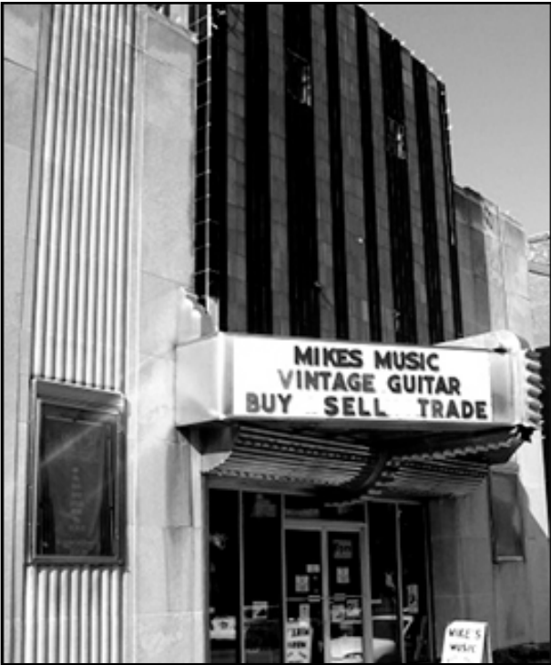
Covington Store at 635 Main Street

His passion for finding rare instruments led him to open his first music store in 1991. Around 1993, he opened the current store, Mike's Music, at its Cincinnati location and a second store in the Covington area 10 years later. The Cincinnati store has three floors full of vintage gear and won a "Best of the City" award in 2014. The number of vintage instruments at this location is usually between 1,000 and 1,500. The second store is located in a 1940's DECO Theatre, one of the rare DECO style buildings in Kentucky, and has as many as 400 instruments for sale at any one time. Mike's Music is one of the larger vintage instrument stores in the world. If they don't have what a customer is looking for they can probably find it. Mike states that, "75% of my business is made up of sales to professional musicians and international collectors." Scenes from the feature film, "Black Dove," starring John Savage, were shot at both the Cincinnati and Covington stores.