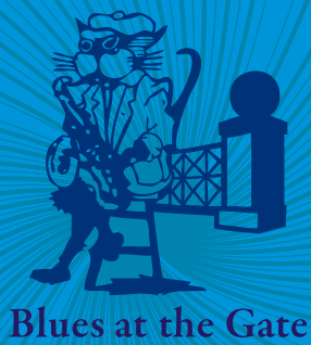
Blues at the Gate