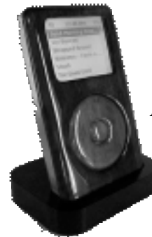
African Padauk case

< http://money.cnn.com/2005/07/05/technology/personaltech/wood_ipod/index.htm >